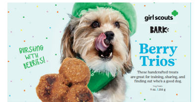
Bark Box – Dog Treats & Toys (non subscription)