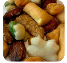
Thai Chili Max