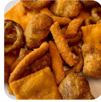
Cheddar Caramel Crunch