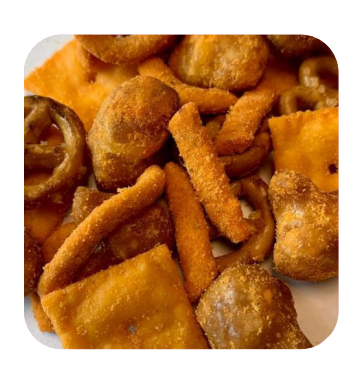
Cheddar Caramel Crunch