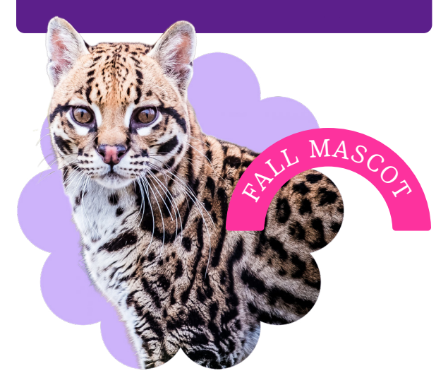
Theme is "Own your Magic"