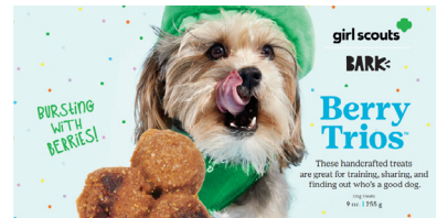
Bark Box - Dog Treats & Toys (non subscription)