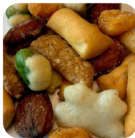
Thai Chili Mix