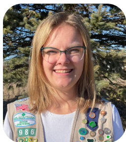
Caydence Pawlowski Musical Sensory Garden