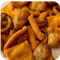
Cheddar Caramel Crunch